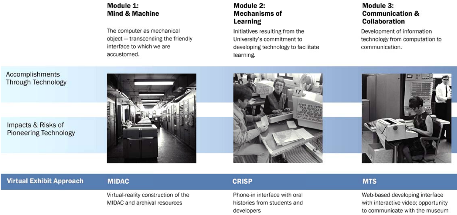
Figure 1: Content Modules