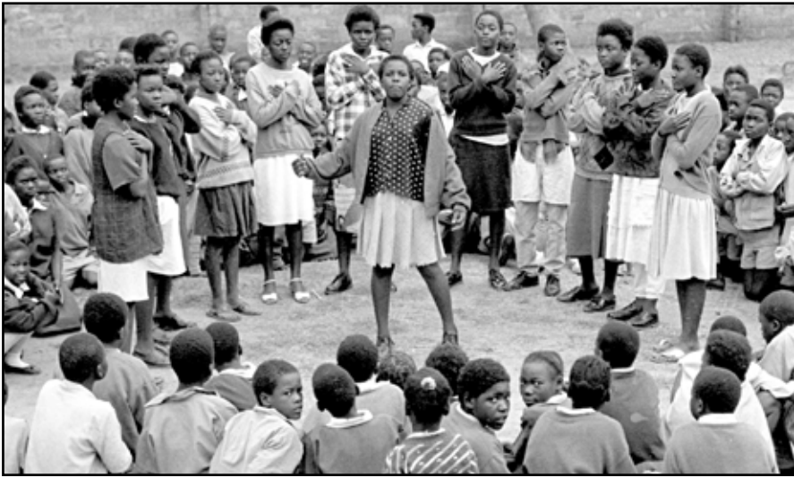
Members of an anti-AIDS club addressing students at a UNICEF-assisted primary school in Zambia.

people in Africa with anti-retrovirals. There has been an unacceptable, indefensible double standard... People in Africa who have AIDS have as much right to life as people in the Western world.” But he cautioned that making affordable drugs available cannot be at the expense of prevention, which “underlies everything.”