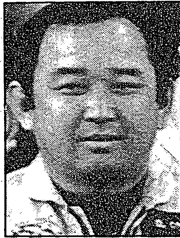
Ellison S. Onizuka Engineer