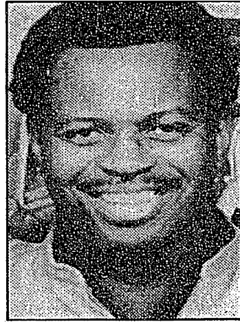
Ronald E. McNair Physicist