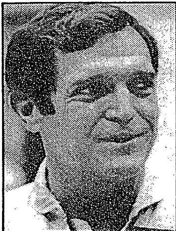
Francis R. Scobee Commander