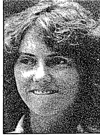
Christa McAuliffe Teacher