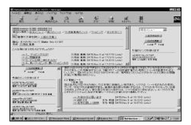
Figure1. ReCoNote windows

ReCoNote has two windows to simultaneously show two learning materials (Figure 1). The materials include student's individual notes as well as group notes, teacher-provided learning materials, and announcements of classroom activities and of the system support. Each note comes with the accompanying "link list," which is a list of comments with author names of links that tie the information in the adjacent window to some other piece of information in the entire note system. When the comment is clicked, the linked information appears on the other window on the screen. All the information can also be summoned up onto one of the windows by going through the menu provided at the top of each note.